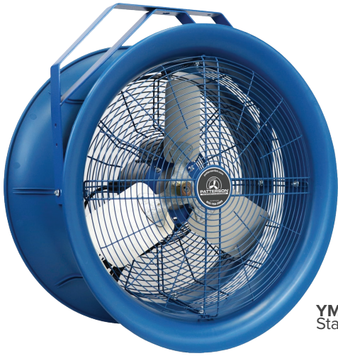
YM Yoke Mount Standard