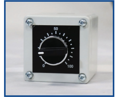
Optional Speed Controller Knob