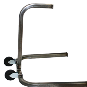
PS Portable Stroller 92 lbs (w/ fan)