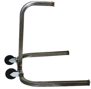
PS Portable Stroller 129 lbs (w/ fan)