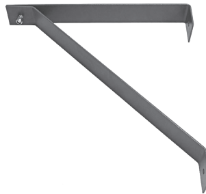
CW Column-Wall 145 lbs (w/ fan)