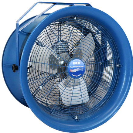
YM Yoke Mount Standard