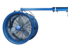
TC Truck Cooler