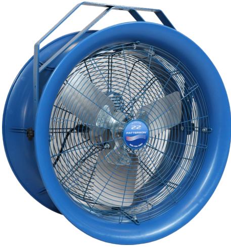
YM Yoke Mount Standard