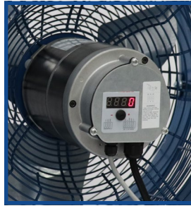
Onboard Adjustment & Speed Indicator