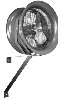
CW - Column Wall