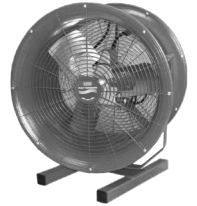
PB - Pedestal Base