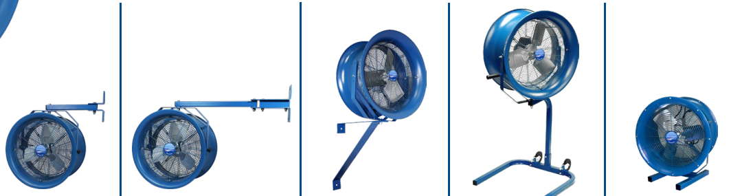
RM Rack Mount TC Truck Cooler CW Column-Wall PS Portable Stroller PB Pedestal Base