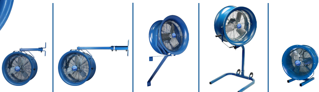
RM Rack Mount TC Truck Cooler CW Column-Wall PS Portable Stroller PB Pedestal Base