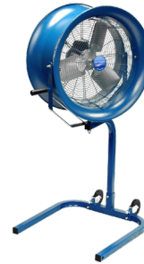
PS Portable Stroller 129 lbs