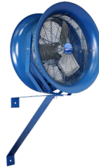
CW Column-Wall 113 lbs