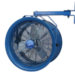
RM Rack Mount 103 lbs