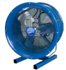
PB Pedestal Base 108 lbs