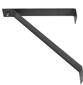
CW Column-Wall 145 lbs (w/ fan)