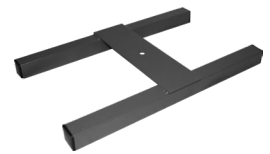
PB Pedestal Base 140 lbs (w/ fan)