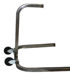
PS Portable Stroller 161 lbs (w/ fan)