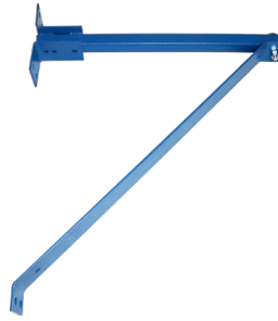
CW Column-Wall 239 lbs (w/ fan)