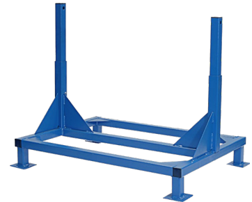
PB Pedestal Base 321 lbs (w/ fan)