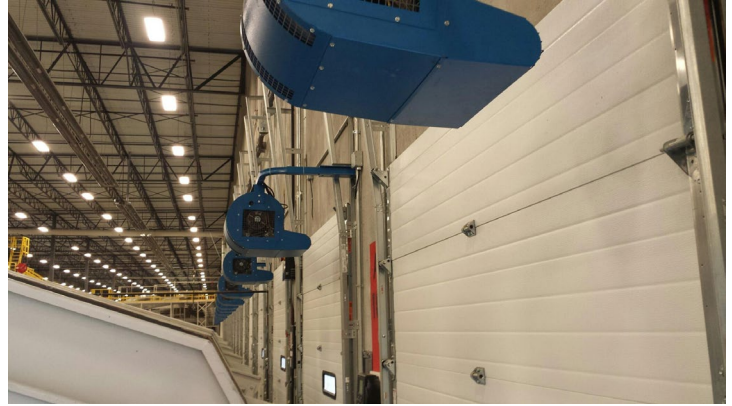
OUT-OF-THE-WAY AIR MOVEMENT