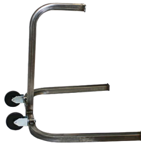
PS - Pedestal Stroller